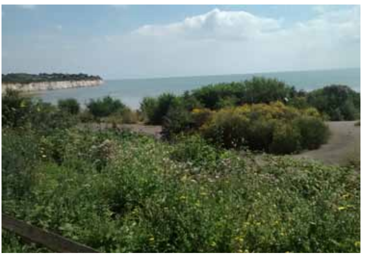
The white chalk cliffs of Pegwell Bay

Viewpoint created by Sonia Overall. Edited by Caroline Millar.